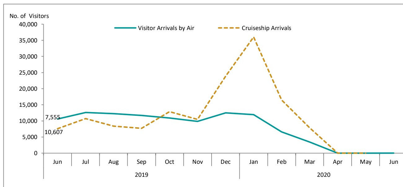
Fig 1: Provisional International Visitor Arrivals: June 2019 to June 2020